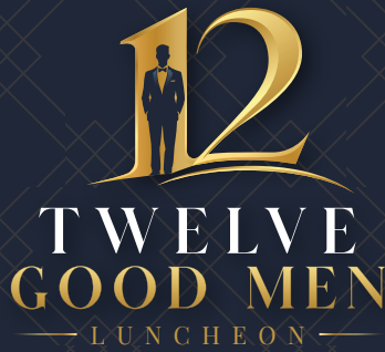
TABLE & TICKET OPPORTUNITIES